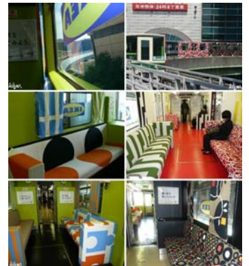
IKEA artfully designed Japanese Monorail Train