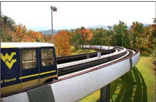
Top: Bombardier driverless APM at the Phoenix Arizona Sky Harbor International Airport Middle: Raytheon PRT Demonstration Vehicle and Station outside of Boston, MA. Bottom: Boeing's Group Rapid Transit System at West Virginia University. Built in 1974.

Often snubbed as an industry outsider, PodCars are getting serious interest from high-level institutions with deep pockets around the world, both in public and private sectors. This includes the likes of Bombardier, the American Society of Civil Engineers, numerous US State DOT's, Universities, and the software might of Silicon Valley.