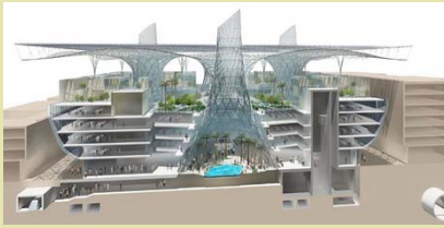
Cut-away of Masdar's "Energy Positive" Corporate Headquarters