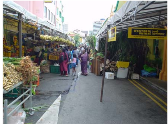
Street Market Scene in one of India's Urban Centers

The specific classification of small cars and tax incentives for such vehicles has accelerated capacity creation for such vehicles from manufacturers such as Suzuki, Hyundai, Nissan, Toyota and Tata. The very cost sensitive auto market has bred frugal product development and frugal investment skills which should support industry's future and global competitiveness. While other constraints and obstacles remain, by and large, the industry is getting better prepared for a bigger global future.